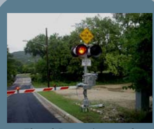
Flood Detection and Closure Systems